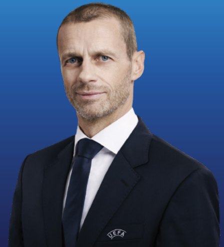
Aleksander Čeferin UEFA President

In this way, you can help make all our football associations more efficient, generate awareness of the specific challenges posed by football law and ensure the long-term health of the game in Europe.